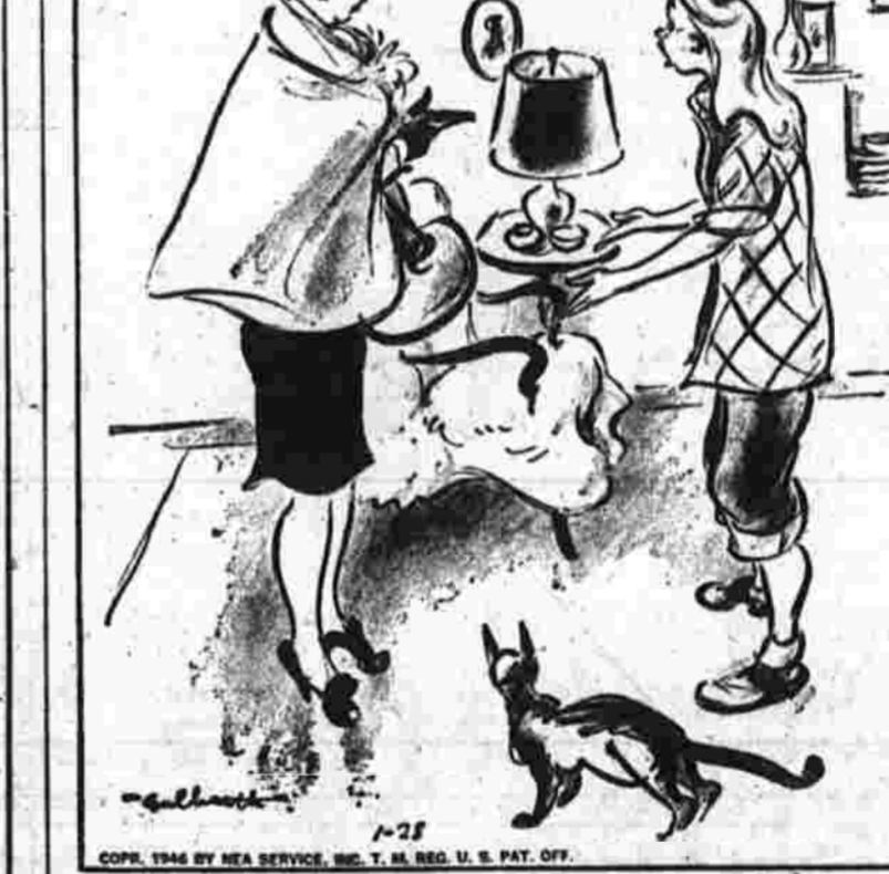
"But, mother, I simply must have another pair of sports shoes—you don't want me to go around looking like a backwoodsman, do you?"