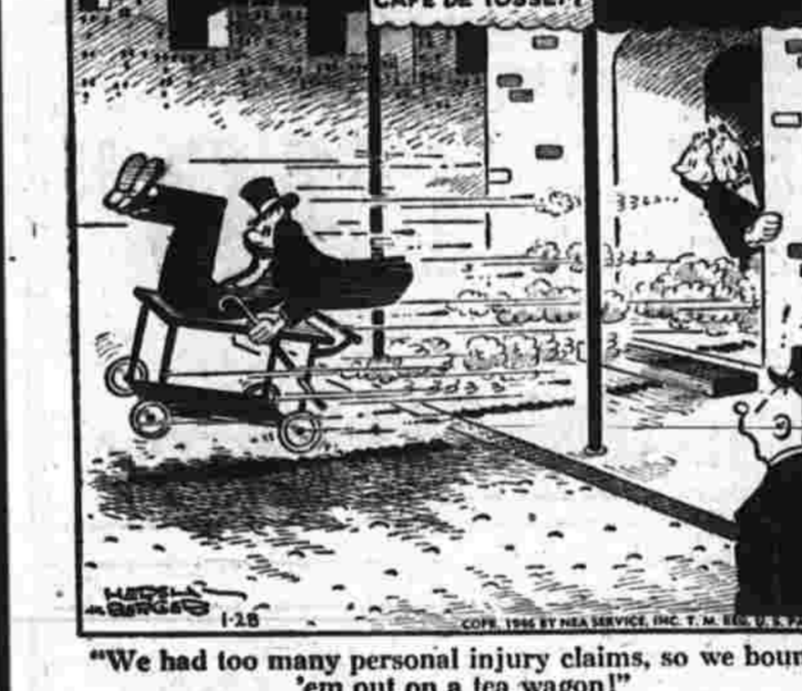
"We had too many personal injury claims, so we bounce 'em out on a tea wagon."