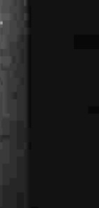
"But, mother, I simply must have another pair of sports shoes—you don't want me to go around looking like a backwoodsman, do you?"