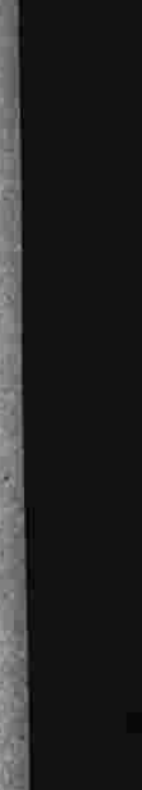
"But, mother, I simply must have another pair of sports shoes—you don't want me to go around looking like a backwoodsman, do you?"