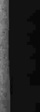
"But, mother, I simply must have another pair of sports shoes—you don't want me to go around looking like a backwoodsman, do you?"