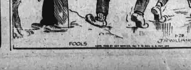
"But, mother, I simply must have another pair of sports shoes—you don't want me to go around looking like a backwoodsman, do you?"